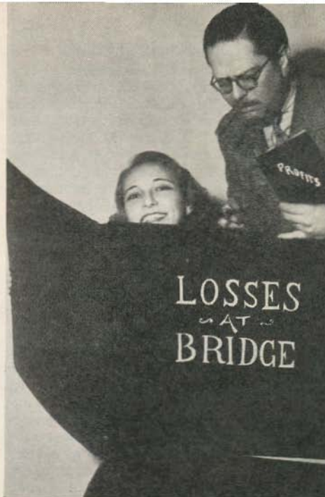
The profit and loss account of the "Easy Aces" is something terrible. Jane thinks Ace is "downright abdominal" about it. CBS Tuesday, Thursday and Saturday at 8:00 p. m. EST.