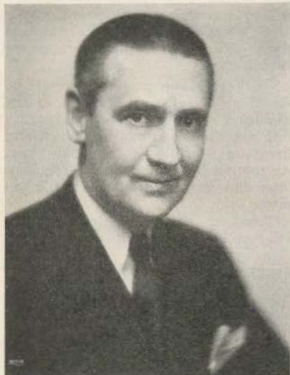
Edwin C. Hill on "The Human Side of the News" Monday, Tuesday and Wednesday at 10:30 p. m. And—don't miss this—Fridays at 9:30 p. m. "The Inside Story of Names that Make News." All CBS.

We doubt whether substitution of 58s for the -35s in your set would be worth-while, and it is likely that the adapters under the 58s would raise them so high that they would interfere with shielding. Try 56s in place of -27s in the second detector and first audio "driver" tube sockets. Do