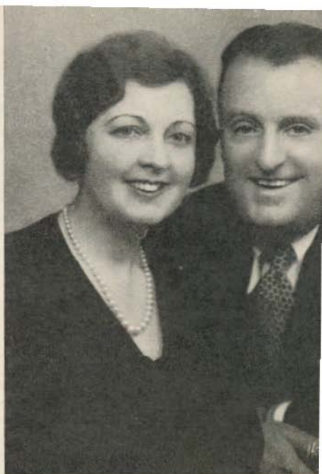
Julia Sanderson and Frank Crumit