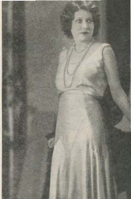
Gay Ellis, Dot Dare, Patsy Young and Annette Hanshaw—all in one.